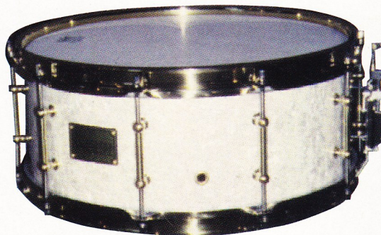
Magstar Vintage snare

If the charm of vintage drum gear has caught your fancy, Magstar wants to talk to you. The company is now offering 1940s-style Vintage series snare drums in a limited edition. And we're talking real limited: Only fifty drums will be built. Each will feature a steam-bent 5½x14 maple shell with solid maple reinforcement rings, tube lugs, hand-rubbed orange shellac on the shell interior, a basic side-movement snare throw-off to reflect those used in the '30s and '40s, a polished white pearl covering, and a choice of either chrome or brass-plated steel counterhoops. Bearing edges will be cut according to the preference of the player, and some "newer" technical embellishments will be combined with the vintage aspects of each drum to maximize its "user readiness." And for that human touch, each drum will be signed and dated by designer Rob Kampa. Prices will range from $529 to $599 depending on options.